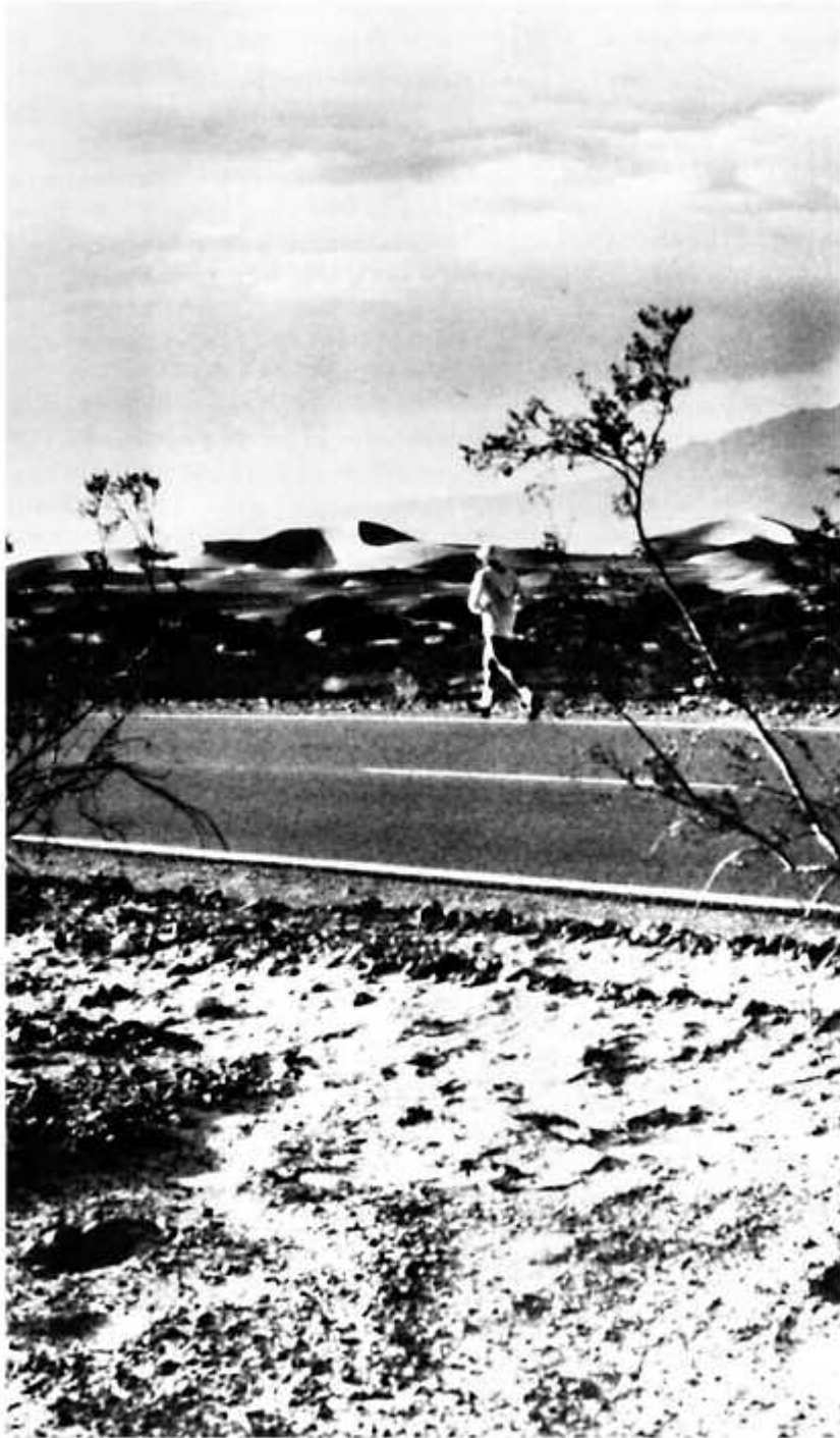
Running past the dunes.

From a postcard by Desert Graphix Trona, California