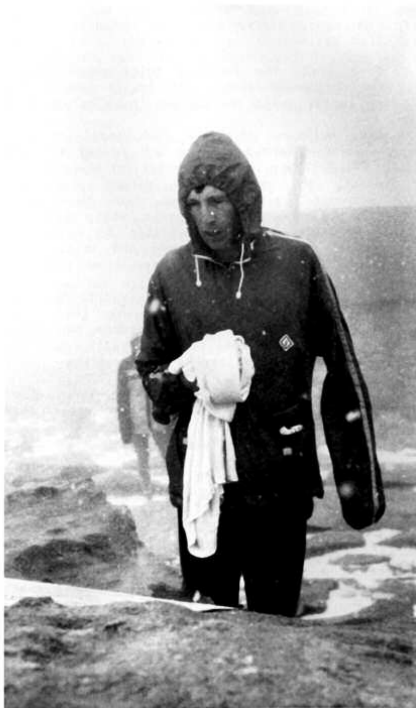
The moment of arrival.