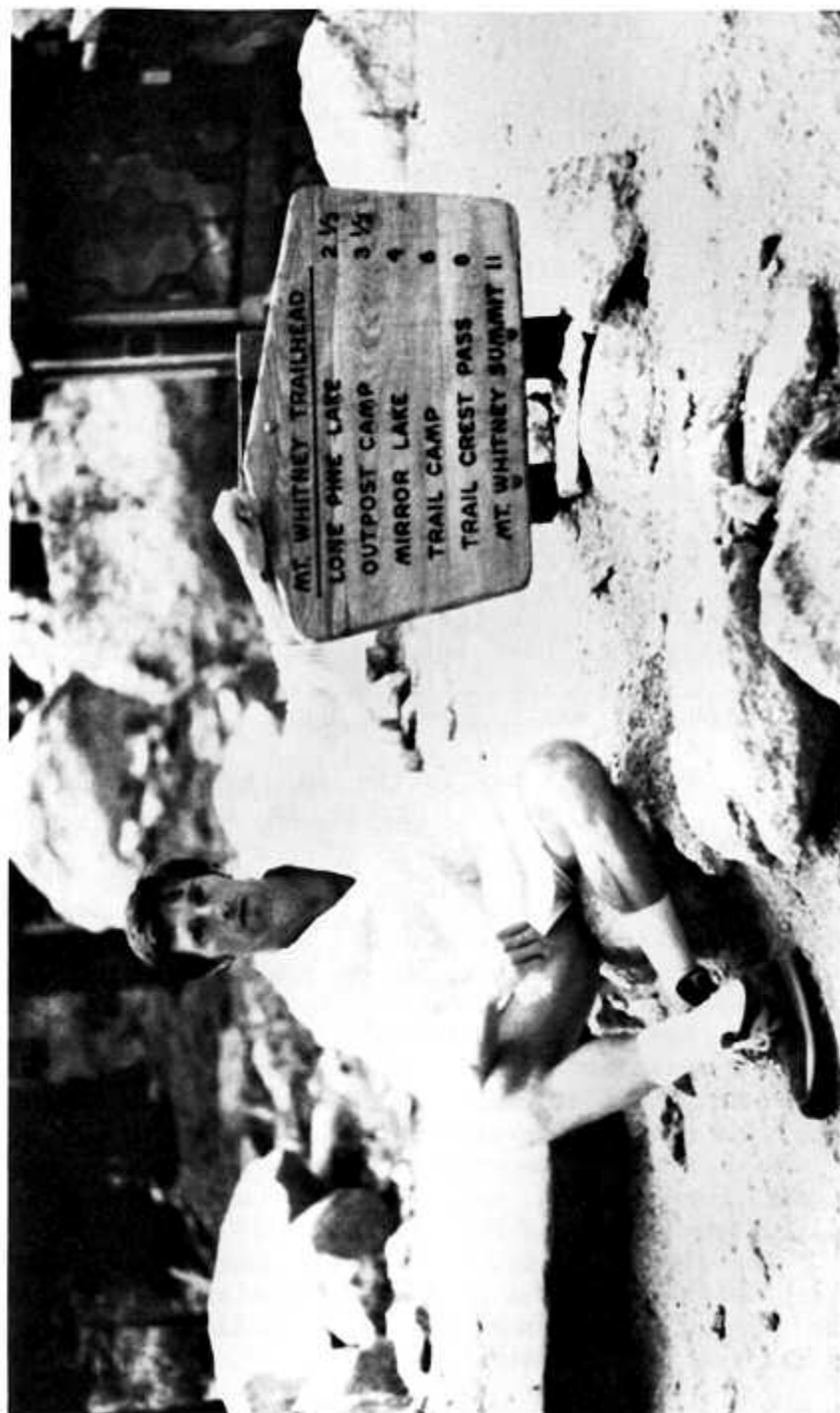
Eleven miles to go.