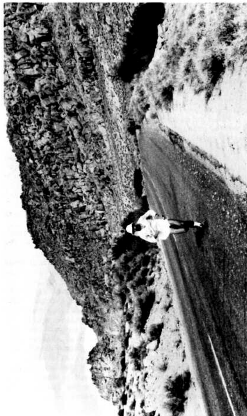
The Alabama Hills